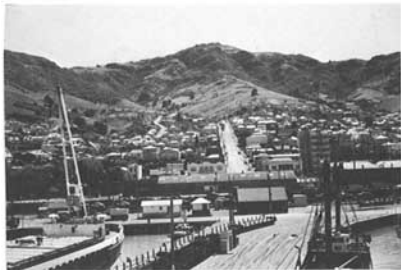
Port Lyttelton and surrounding hills.