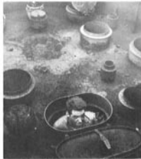
Terry Dominisse crawls out of the stack after repairing ship's horn.