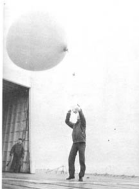
... and off she goes!