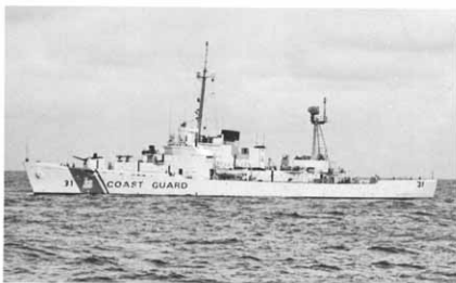
"Boy, are you a beautiful sight!"

September 7th was a great day for all hands as the USCGC BIBB relieved us at the end of our last patrol. We happily hoisted the "Haulin A" flag and set sail for Singapore. From there we went to Subic Bay for the last time where we off-loaded our remaining ammunition and had some engineering repairs completed. Then, of 24 September, off towards Long Beach.