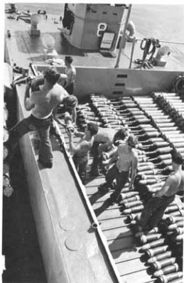
We got to unload ammo for a change.