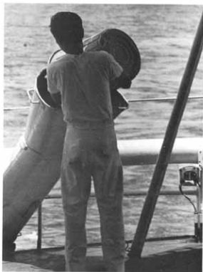
"I'll bet Mendoza wanted to re-heat this for tomorrow."