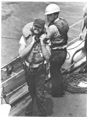
"The Oiler's C. O. said, 'please don't hit us again!'"