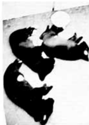
First seadog: "You're right . . . does ride like an ocean liner . . ."

Mr. Porter: "Give him mouth-to-mouth anyway . . ."