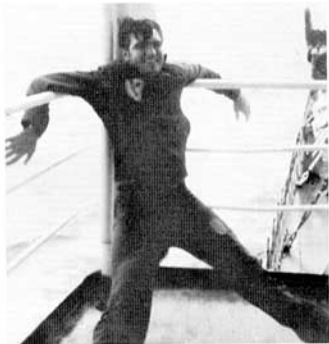
"What?—me seasick? . . ."