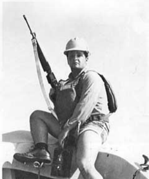
Small Boat Shark Watch SN Boyington

For some, after 10 days of sailing, the days seemed to drag by. But for all aboard the CGC BURTON ISLAND, the days and nights were definitely getting hotter. Having crossed the equator the morn' of 30 November, the engine room temperatures peaked at 140 degrees plus. Everyone needed a change. So at 1500 hours, the small boat was launched, the shark watch was set, and swim call was granted to all hands. It was greatly needed as well as a well deserved break from the daily routine.